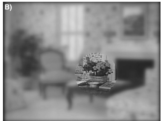
Figure 1. (A) A schematic representation of a gaze-contingent, two-region, variable-resolution display. The high-resolution central region tracks the viewer's center of gaze. (B) A variable-resolution display used in Parkhurst et al. (2000) study, with the high-resolution central region centered on the flowers.